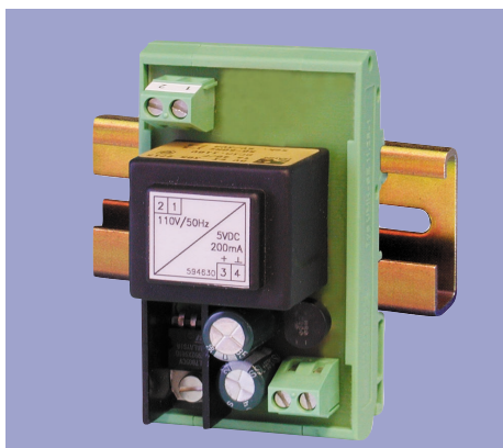
115 VAC converter (Model DPM501)