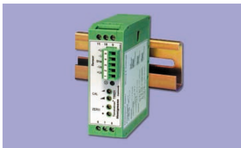
TS621 Strain Gauge Amplifier