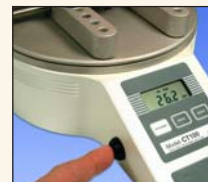
Optional Data Output Package.