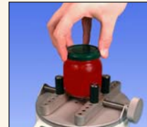
Simple Hand Operation.