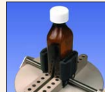
Optional Sample Gripping Jaws.