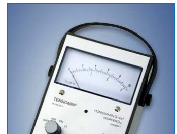
TM-383 Tension Indicator with Analog Outputs – $895.00