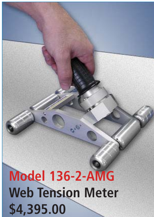
Model 136-2-AMG Web Tension Meter $4,395.00