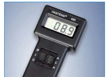
D-485 Digital Tension Indicator with Built-In Amplifier – $995.00