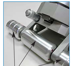
Ball bearing mounted reference rollers