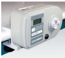
Optional bench mounting bracket