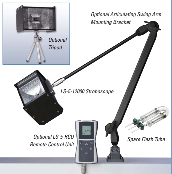
Optional Articulating Swing Arm Mounting Bracket