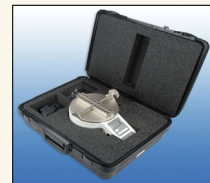
Optional Hard Plastic Carrying Case