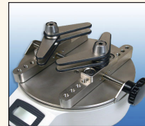
Optional Sample Gripping Jaws.