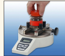
Simple Hand Operation.