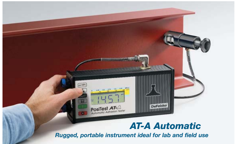
AT-A Automatic Rugged, portable instrument ideal for lab and field use