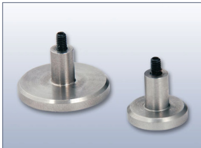
Presser feet in different diameters suit a wide range of testing requirements.

MTG Benchtop Contact Thickness Gauge provides accurate dimensional (thickness) testing of rubber, fabrics, foams, tapes, films and a wide variety of other materials.