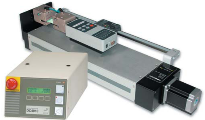
The ESMH-DC is shown in a peel testing application, with Series BG digital force gauge, digital travel display, and pneumatic film & paper grips

The ESMH-DC's controller adds a significant amount of sophistication, including an extended speed range, PC control capability, programmable cycling, auto return, overload protection, and other features.