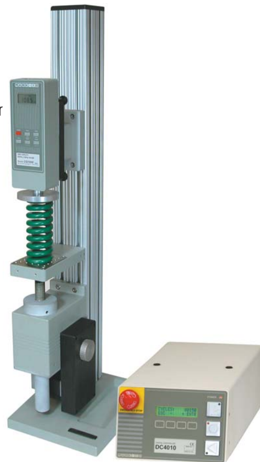
The TSFM500-DC is shown in a typical spring testing application, with Series CG digital force gauge and compression plate.