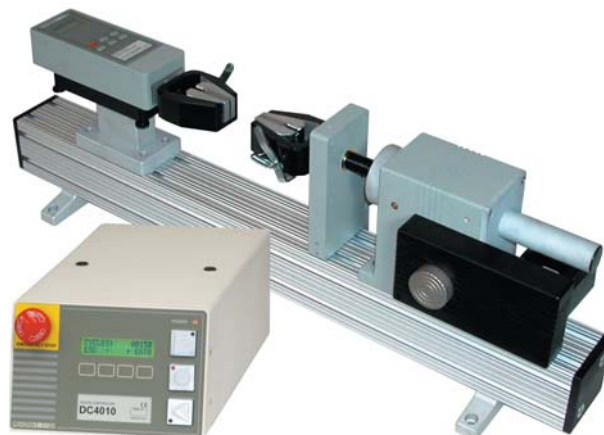
The TSFM500H-DC is shown set up for a tensile test, with Series CG digital force gauge and wedge grips.

Connects a Series BG force gauge with a PC. Bypasses the controller.