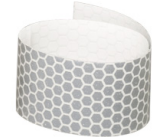
Reflective Tape Item # 205T