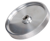
12" Measuring Wheel Item # LMA-3