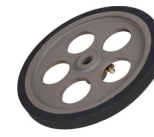
12" Measuring Wheel Item # DT12